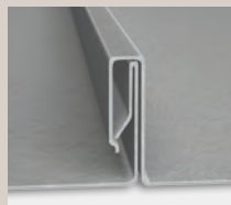
SL-1750 AFTER LOCKING