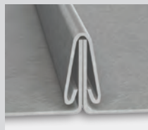
CS-100 AFTER LOCKING